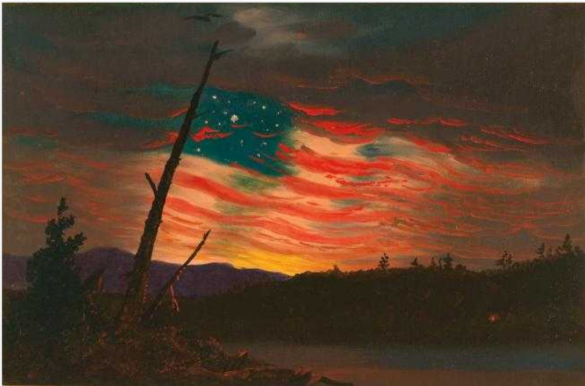
Our Banner in the Sky (1861) Frederic Edwin Church (1826-1900) de Young Fine Arts Museums, San Francisco

I will provide an update on the search for the memorial window in the next issue. In the meantime, the search has begun for other lost treasures of the regiment, including the following: