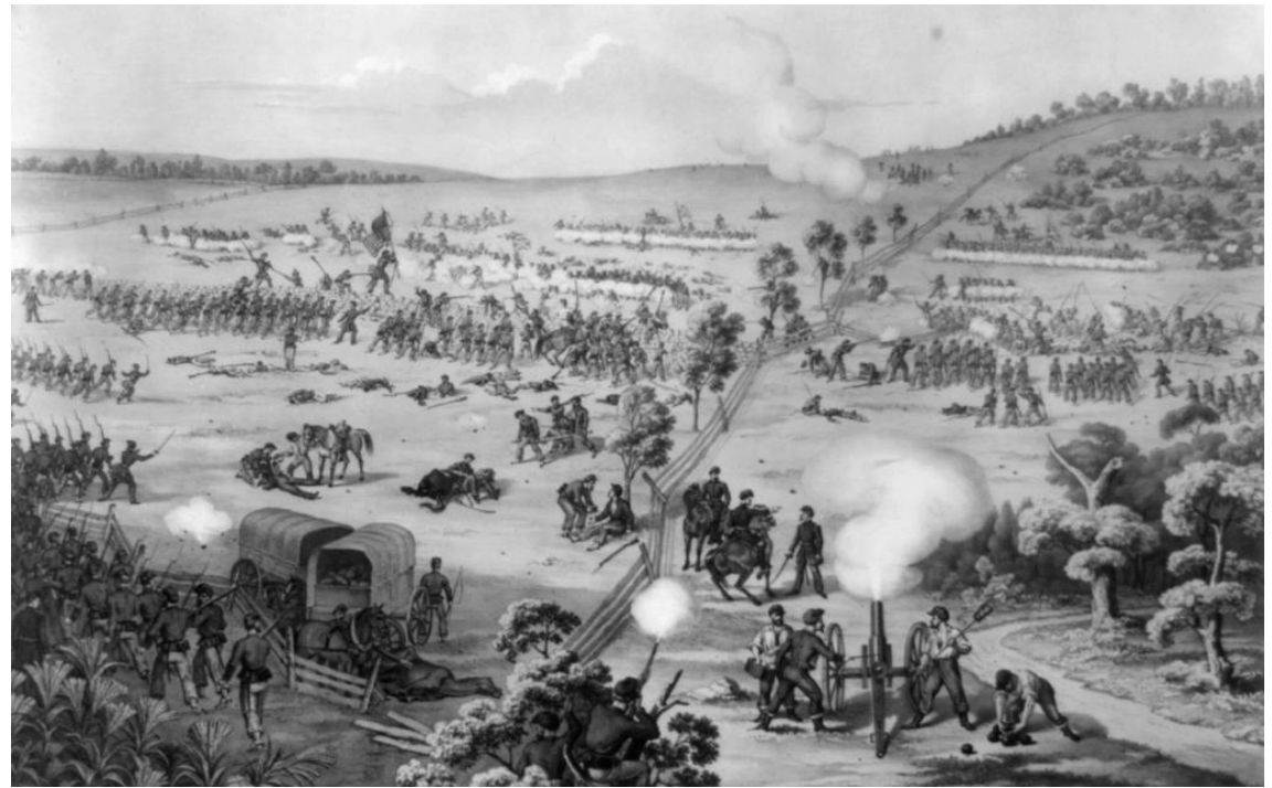
Battle of South Mountain, 1862, (Library of Congress, USA)