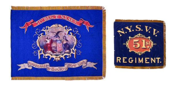
Regimental Colours and Flank Marker of the 51<sup>st</sup> New York Infantry Regiment.