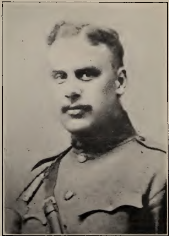
CHARLES D. BAKER