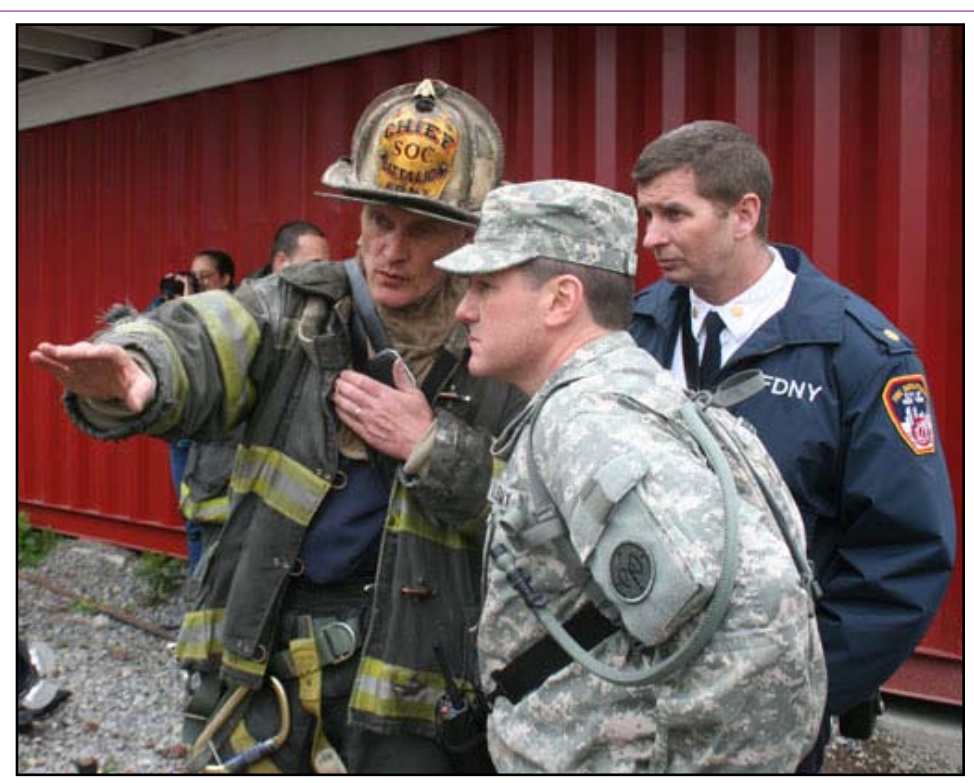
Members of New York's CERFP team conduct a joint training exercise with fire Department of New York firemen on Randall's Island in New York City.

Our joint effort in 2008 also saw the complementary force for the CST train and validate. Members of the Army National Guard, Air National Guard and New York Guard trained as response forces in New York's CBRNE Enhanced Response Force Package (CERFP). The CERFP provides traditional National Guard members with the skill sets, equipment and training to conduct casualty evacuation, decontamination and medical triage in the event of a CBRNE or Hazardous Material incident.