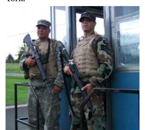
Army and Air Guardsmen standing guard outside of Indian Point Nuclear facility

lyn, JTF Empire Shield provides a planning and coordinating head-quarters for all domestic operations in support of New York City. The task force peaked at approximately 500 members in 2008, providing security forces to partner with local law enforcement during the city's Papal visit, security support to the city's airport and rail terminals and provided additional forces to secure nuclear power stations in the lower Hudson Valley and upstate New York.