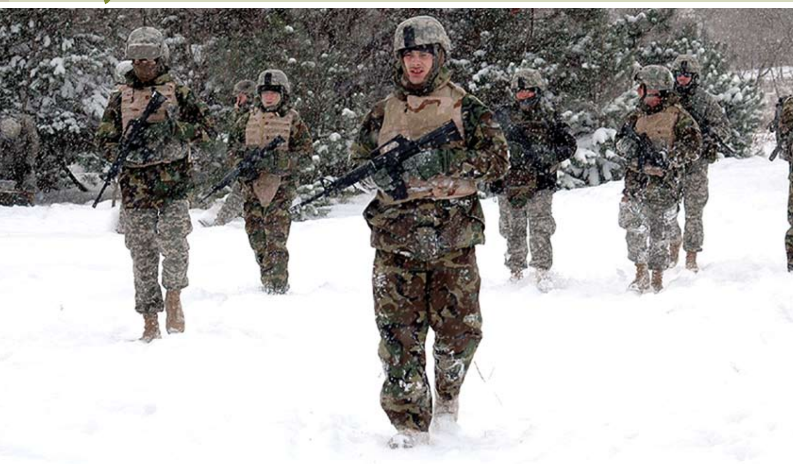
27th Brigade Combat Team Infantryman doing pre-mobilization training at Fort Drum, N.Y. months before they deployed to Afghanistan to train Afghan police.

The New York Army National Guard began 2008 running and kept the pace throughout the year.