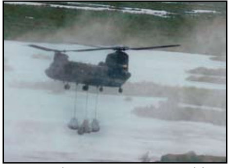
New York Army aviation Soldiers use their Chinook to build a levee during Hurricane Gustav

Empire Shield reorganized in the spring of 2008 to better respond to the needs of New York City security threats and adopted the New York