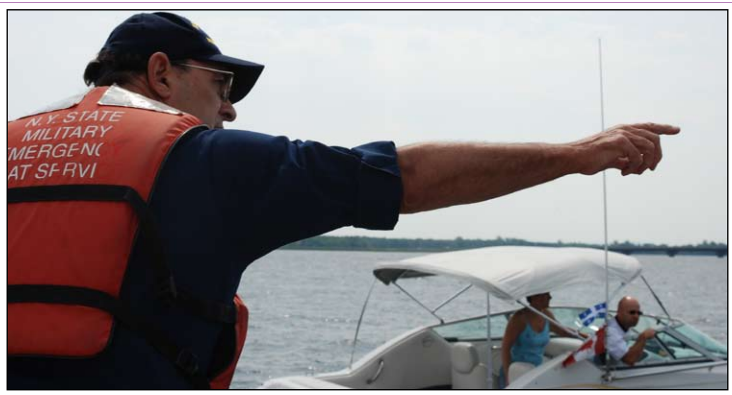
The New York Naval Militia on Lake Champlain working with the U.S. Border Patrol

The New York National Guard Joint Forces Headquarters emerged in 2008 as a valuable and relevant force for supporting domestic operations and homeland security missions across the state. From training exercises to actual disaster response missions, the joint forces of the National Guard remain ready, reliable and relevant for the Empire State.