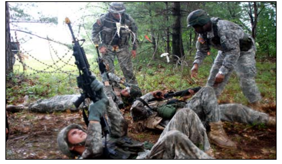
New York's 14th Finance Detachment Soldier's undergo rigorous training under the watchful eye of the New York Army National Guard's Pre-Mobilization Training Element at Fort Drum.

The return home marks another significant event for the New York Army National Guard in 2008 – the implementation of the state's Yellow Ribbon Reintegration Program. Begun in the spring of 2008, the consolidated efforts of the Army National Guard alongside other state agencies will provide health assessments, education benefits, labor and job counseling, family support and veterans' benefits overviews to all of the state's returning combat veterans and their families as New York welcomes its Soldiers home and helps with the transition back to civilian life.