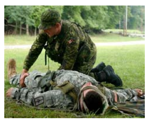
Combat Engineer Regiment, based in Toronto, Ontario. The Army Guard engineers conducted a "best

And Soldiers from the Binghamton-based 204th Engineer Battalion formed bonds with troops from the Canadian Land Forces' 32nd