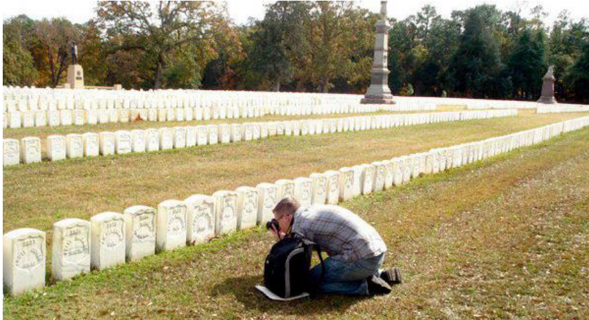
Figure 1: Finding and photographing graves at Andersonville, Georgia in November, 2011.

There are over 1400 soldiers associated with the 49 th New York Infantry Volunteers recorded in the historic unit roster, made available by the New York State Military Museum and Veterans Research Center. The project was started in late 2011. As of April, 2014 efforts have identified the grave locations of approximately 35% of the