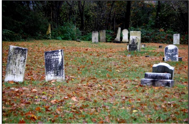
Figure 13: Hemenger Cemetery, Chautauqua County, New York