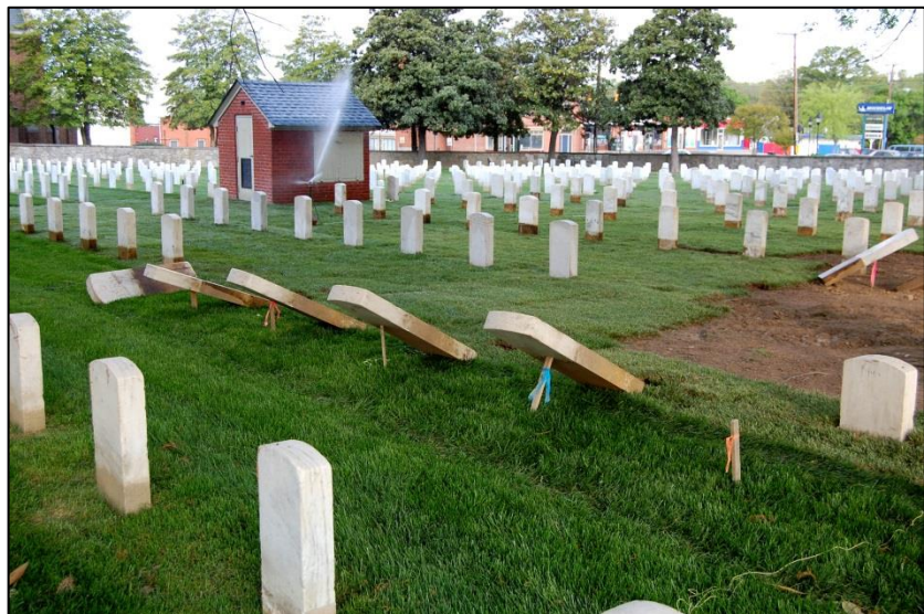
Figure 16: Raising markers at Richmond National Cemetery.

Ongoing maintenance efforts to address the sinking problem were found at the Richmond National Cemetery in Richmond, Virginia as pictured in Figure 16. Sunken stones are pulled up, the holes partially refilled to re-lift the markers, and the markers are replaced.