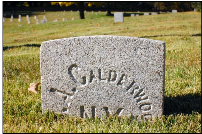
Figure 15: 49 NYVI Private Hugh A. Calderwood's Sinking Marker at Fredericksburg National Cemetery

Another physical effect upon cemetery markers found along the journey included the effect of stones literally being enveloped by large tree trunks, or in other instances, sinking under their own weight into the ground. Though the challenge isn't unique to any one cemetery, good examples of the effect and need for periodic maintenance were on display at Fredericksburg and Spotsylvania National Cemetery, Fredericksburg, Virginia, and at Richmond National Cemetery in Richmond, Virginia. The Fredericksburg National Cemetery contains the graves of over 15,000 Union soldiers, only 20% of which are known soldiers. Grave markers at the Fredericksburg National Cemetery are very unique compared to all other National Cemeteries visited thus far, they tend to be smaller stones fashioned out of hardy stone material with deeply engraved identification information. The threat to the many stones there is not weathering but rather sinking. Figure 3, above is an example of the sinking effect at Fredericksburg National Cemetery. The grave pictured in Figure 15 is that of Private Hugh A. Calderwood of the 49 th New York Volunteers. Private Calderwood was killed in action on May 6, 1864 at the Wilderness.