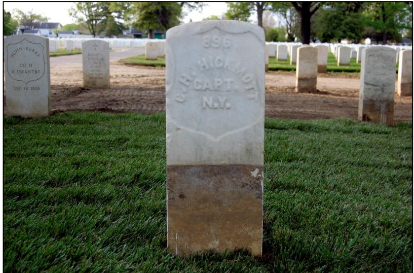
Figure 17: Evidence of stone sinking at Richmond National Cemetery.