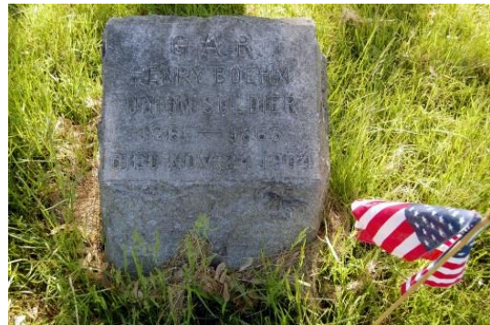
Figure 14: Concordia Cemetery, Buffalo, NY

Fortunately the grave marker of Private Henry Boehm at Concordia Cemetery on Buffalo's east side, as pictured in Figure 14, was found in good condition and had been marked by an American Flag for service. His marker was photo documented for the project. Private Boehm survived the war and passed away on November 24, 1904. The history and past plight of Concordia Cemetery was noted in an October 29, 2012 report entitled Making a Difference: Concordia Cemetery by Buffalo, New York NBC network news channel WGRZ 2: