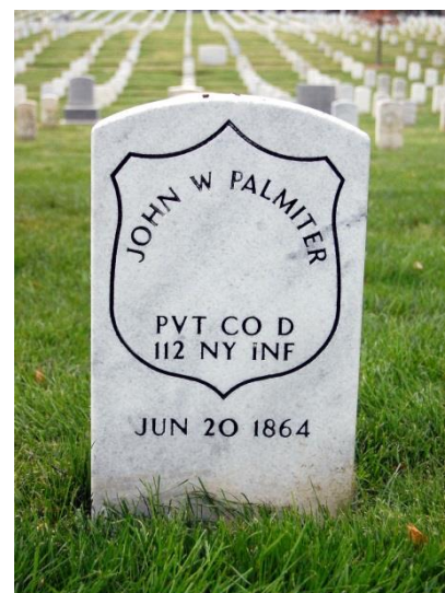
Figure 2: Verification mystery

Due to a number of mysteries and conundrums, not unlike those occasionally raised on the Fredericksburg and Spotsylvania area Civil War Mysteries and Conundrums blog (hosted by National Park Service Staff), unfortunately I am unable at this time to definitively verify every grave linkage. In instances where questions still exist, I have noted the concern within the notes column of the attached tables. The vast majority of linkages have been verified and those that still have questions are generally based on finding materials definitively linking the interred to the 49 th New York. In such instances I typically have exact name, date, age, geography similarities, even acknowledgement of military service, but may not yet have that “smoking gun” tie to the 49 th . A great example of this is related to Sergeant John W. Palmiter. As per the 49 th unit roster, Sergeant Palmiter enlisted August 22, 1861 at age 25 in Fredonia, New York to serve three years. He mustered in as