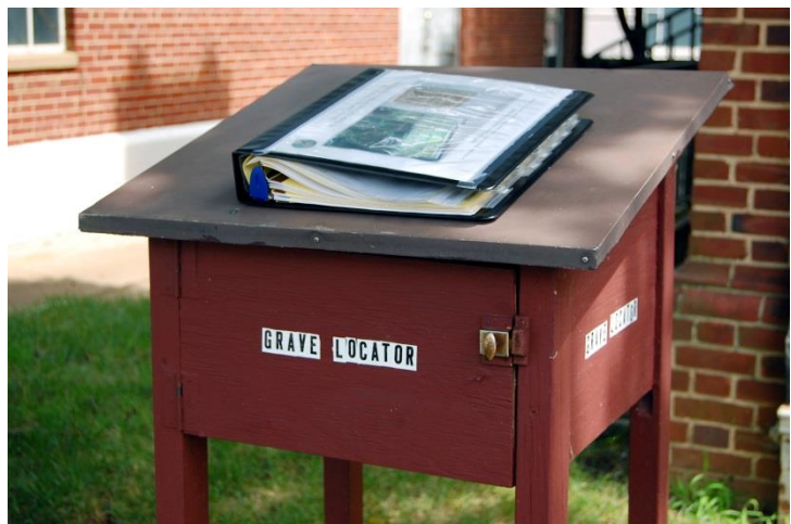
Figure 4: Grave Locator book at Annapolis National Cemetery, Maryland

After searching the New York section for a good deal of time and even looking into a few other sections of the cemetery while fighting allergies, I ended up travelling to the battlefield visitors center to inquire. Many national cemeteries have cemetery reference books available on site at the cemetery but this was not the case at Gettysburg. Examples I have found with paper copies of maps and internment rosters include, but are not limited to Alexandria National