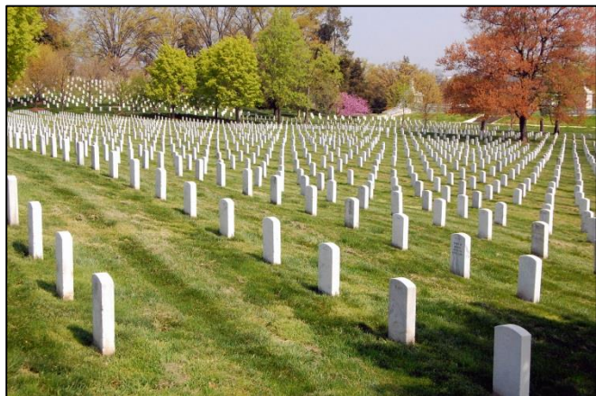
Figure 12: Arlington National Cemetery, Arlington, Virginia

Beyond the condition of markers themselves, general cemetery maintenance and security are important factors in efforts to preserve the integrity of the markers. Many cemeteries have been well managed, maintained, and secured for many years and the condition of their markers tend to benefit from that. Forest Lawn Cemetery in Buffalo, New York, Arlington National Cemetery, in Arlington Virginia (Figure 12), and the US Soldiers and Airman's National Cemetery in Washington, DC appeared to be very well taken care of.