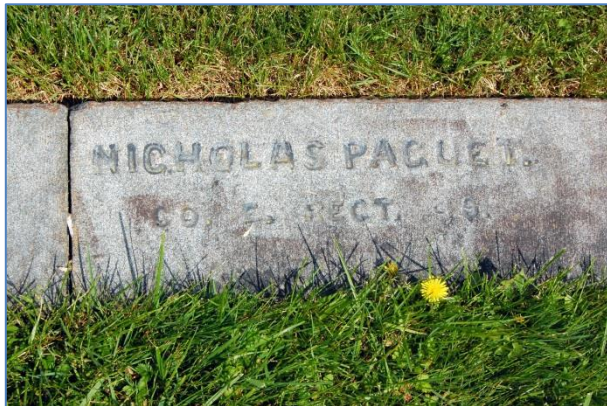
Figure 5: Private Nicholas Baquet, 49 NYVI, at Gettysburg National Cemetery

short drive I was back and successfully located the soldier I had sought. The grave of Private Baquet is pictured below in Figure 5. Like the Fredericksburg National Cemetery, the grave markers at Gettysburg National Cemetery I have found to also be unique compared to many of the other National Cemeteries visited that tend to have similar upright style white colored stones. The flat stones are arranged into long curved rows to establish a half circle around the Soldiers National Monument there. The bands of stones can be seen in Figure 6, below.